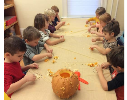
The Pre - 3 Class studied pumpkins, sorting, and counting seeds to make learning FUN!

Our program at St. Leo Preschool provides morning and afternoon sessions for children ages 3-5.