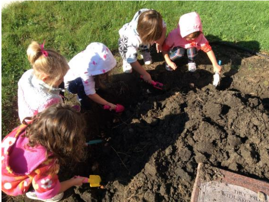
The A.M. Class studied Tulips in the Fall and planted many in front of our school!